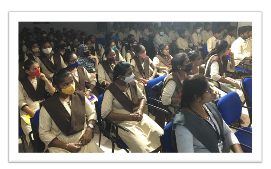
Participants at the National Level Webinar